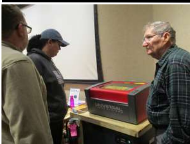
Laser Cutter Training and Projects