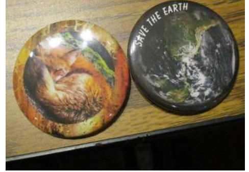
Nebraska City Middle School students trained on the button maker and created their own designs.